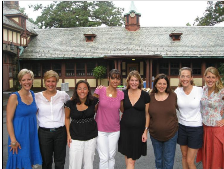
2008- 2009 RPE Board